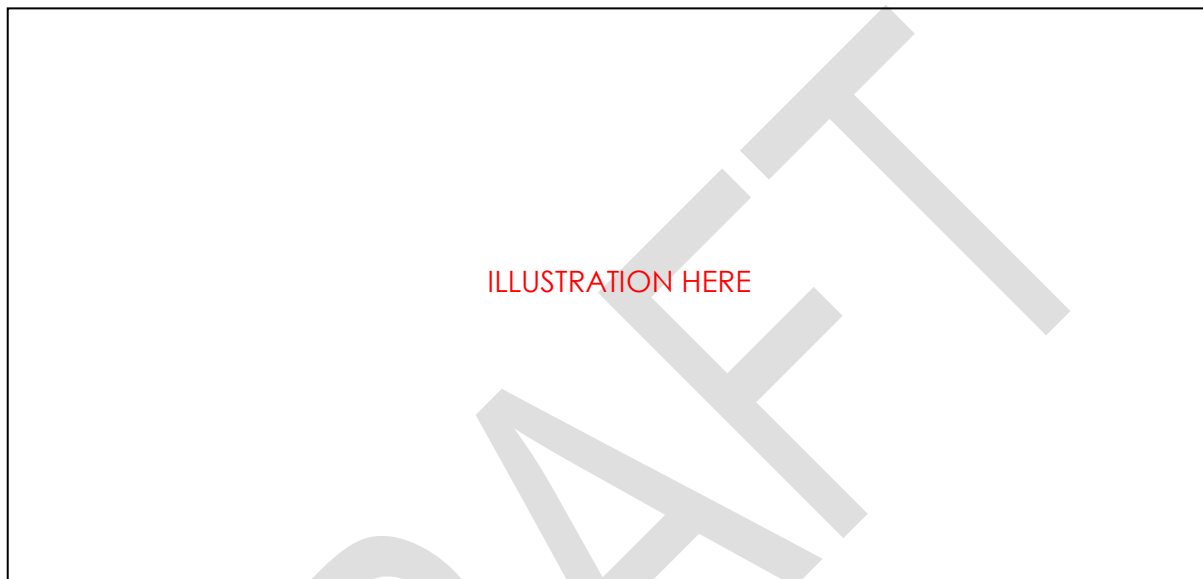
Figure.2 – Illustration of cyclical gully cleansing operations.

We will continue to target our gully cleansing resource to areas where the gullies need cleansing more often. By applying a risk factor to every one of our gullies based on flood risk and road hierarchy we have been able to prioritise which gullies need to be fixed first when a problem is reported.